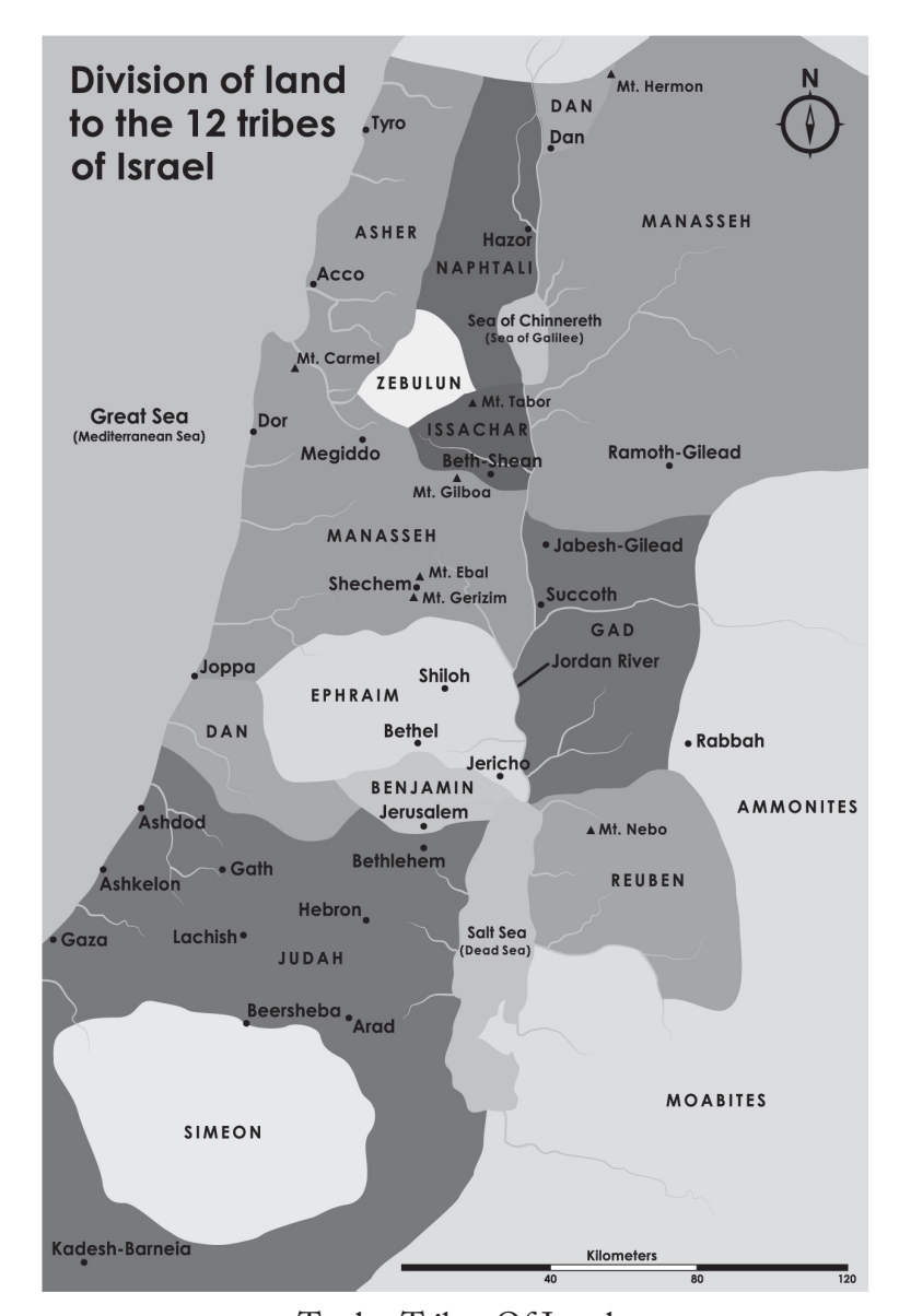
Twelve Tribes Of Israel